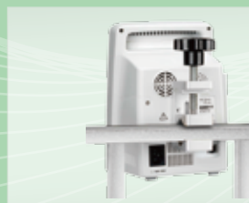
Bed Rail Clamp