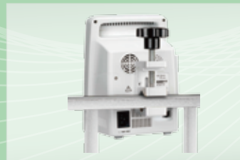
Bed Rail Clamp